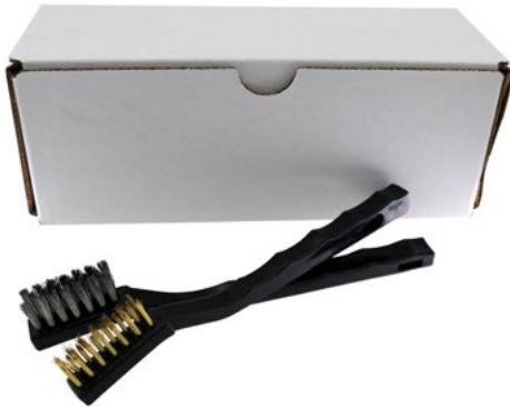
12 Plastic Handle Compact Scratch Brushes - Stainless Steel & Brass Assortment