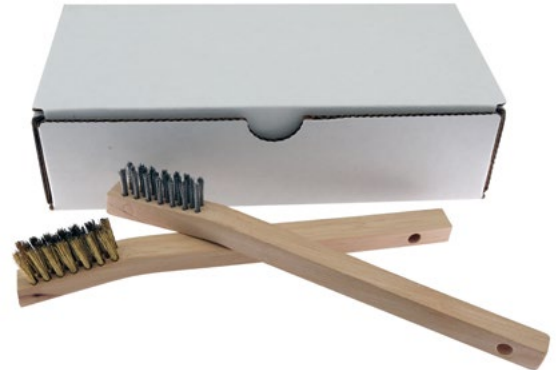
12 Wooden Handle Compact Scratch Brushes - Stainless Steel & Brass Assortment